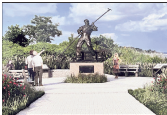
A rendering of the memorial site.

The community is cordially invited to the dedication of the Baymens Memorial Statue. The ceremony takes place Wednesday June 3, 2026 at 1:00 PM (Rain date Thursday June 4th) at the Theodore Roosevelt Memorial Park, 25 West End Avenue, Oyster Bay.