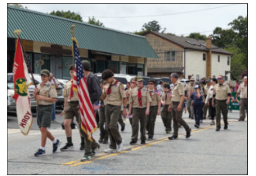
Boy Scouts marching in the Bayville parade.