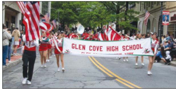
The Glen Cove High School Band.