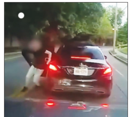
Teen attacker leaps from a Mercedes in Bayville.

Shortly after this incident, the teens attacked a 25-year-old woman on Bayville Avenue in Bayville.