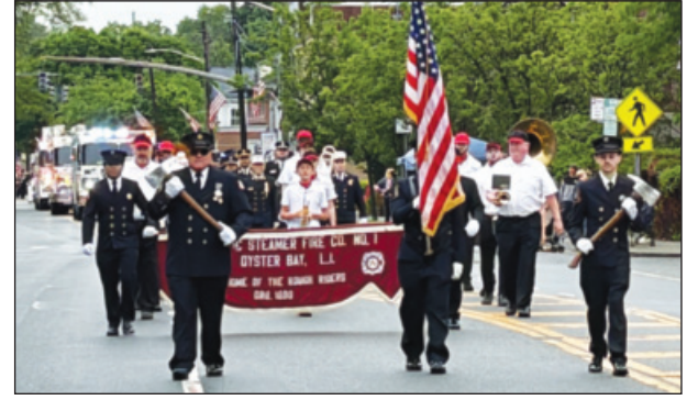
Atlantic Steamer Fire Company No. 1