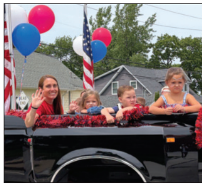
Nursery school is all smiles.