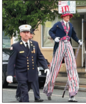
Oyster Bay Fire Department