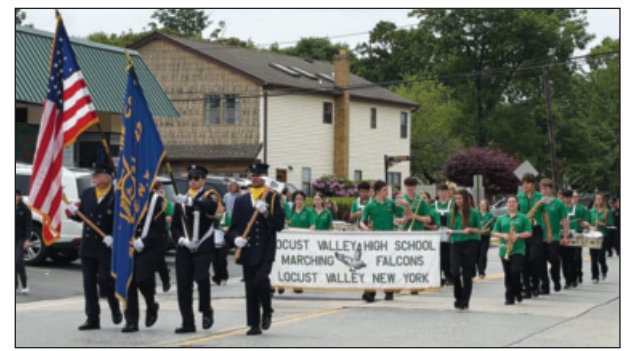
Bayville Fire Company No. 1 leads the Locust Valley High School Band