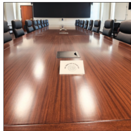
"We 'Wood' Like to Thank You" card displayed on the conference table.