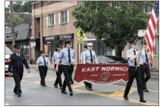
East Norwich Fire Department.