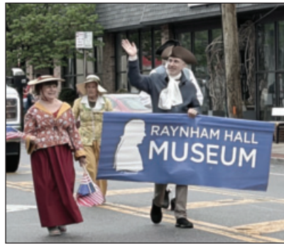
Raynham Hall Museum in Oyster Bay