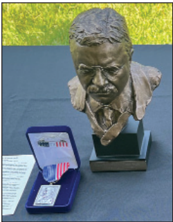
The Theodore Roosevelt Police Award

Despite the serious injuries, surgeries and physical therapy, miraculously he returned to work in October of 2022, and was assigned in the