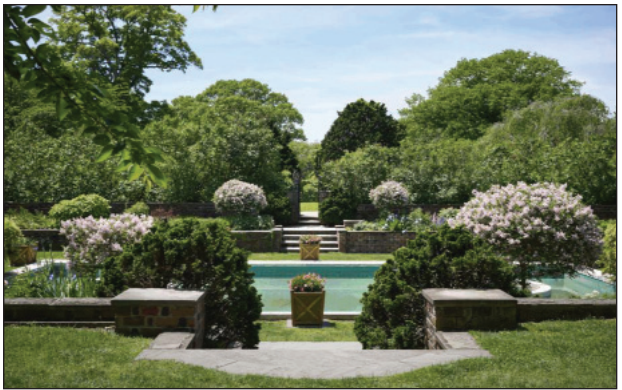
The Gardens at Planting Fields