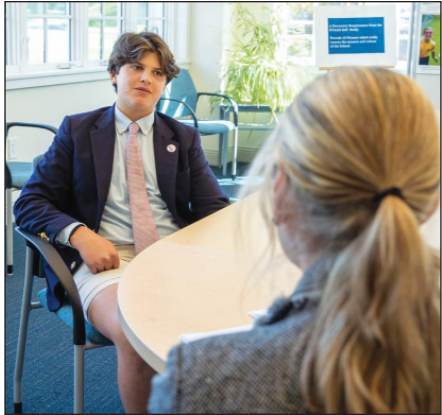
Meeting with the Exmissions Team