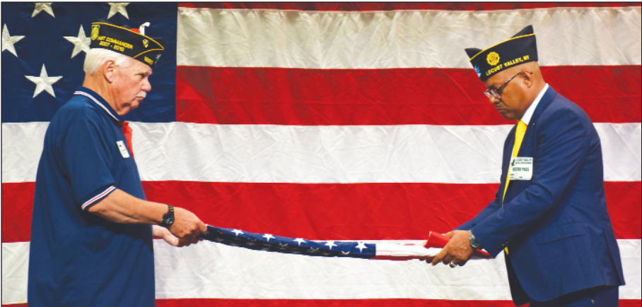
Bayville and Locust Valley veterans folded the American flag as students read about the symbolism behind each fold.

Locust Valley High School hosted its annual Flags for Freedom event in partnership with local organization Operation Democracy on June 6. The ceremony gave each members of the Class of 2025 a moment to appreciate our heroes who sacrifice so much for them and acts as a lesson on flag etiquette and symbolism. Veterans from Bayville American Legion Post 1285 and Locust Valley American Legion Post 962 demonstrated how to fold the American flag and what each fold of the flag represents. Each student met a veteran on stage, took time to get to know each other and received a flag and a copy of the U.S. Constitution to take home. “Today, I encourage the Class of 2025 to reflect on the sacrifices