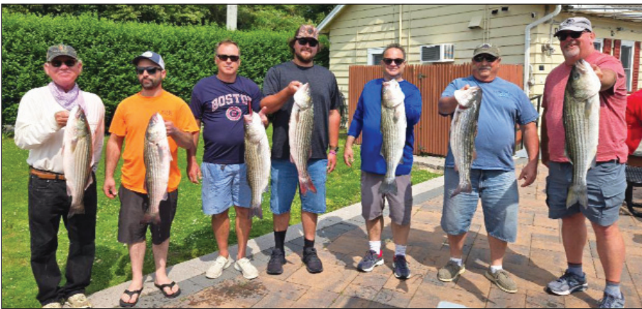
The top seven winners with thier Striped Bass.

The Matinecock Rod and Gun Club hosted the Annual Wade Denning Four Way Inter-Club Striper Derby weigh-in and breakfast at their clubhouse in Glen Cove, Sunday June 8th.