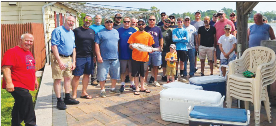
The members of the Matinecock Rod and Gun Club that hosted the derby, and breakfast.

Notice of Formation of AM & UJ Enterprises LLC. Articles of Organization filed with the Secretary of State of New York SSNY on May 2,2025. Office located in Nassau County. SSNY has been designated for service of process. SSNY shall mail copy of any process served against the LLC 5 Westfield Pl Glen Cove, NY 11542. Purpose: any lawful purpose.