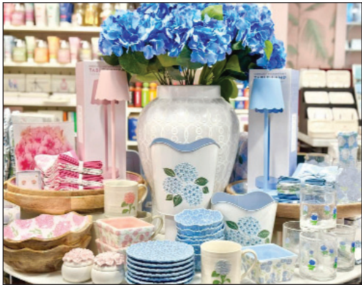
So many gift items can be customized.

A list of the ten top selling candles inside the store shows Driftwood and Juniper as the number one best seller between January and April of this year,