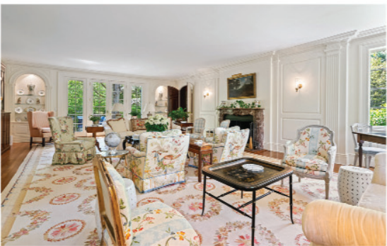
Light-filled Living Room