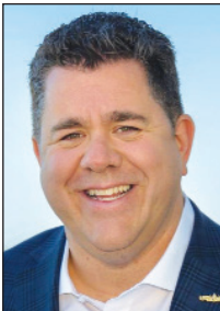
Congressman Nick LaLota

Members of the New York and New Jersey Congressional Delegations sent a letter to President Donald J. Trump and U.S. Secretary of Transportation Sean Duffy, thanking them for their leadership in fighting to block New York Governor Kathy Hochul's controversial con-