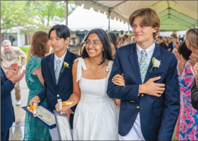
Thr last day of school!