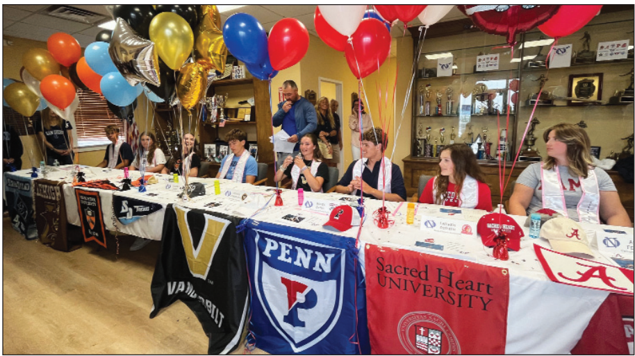
Oak Neck Crew Team signing commitments.