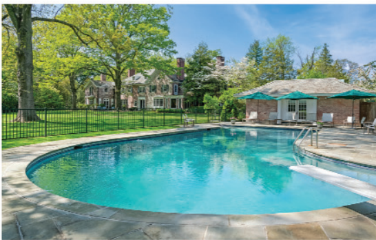
Granite Pool with Cabana