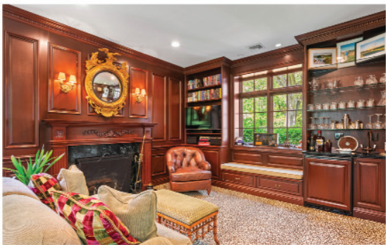
Paneled Library with Fireplace

A true masterpiece blending classic architecture and old-world charm. Masterpiece Collection Listing. MLS# 860758, $3,750,000.