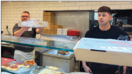
Keeping up with the orders at Ralph's Pizzeria.

The support was amazing, Ralph's Pizzeria in Bayville was packed with families enjoying delicious pizza, as Ralph's phone was ringing off the hook for more orders. All the Pizzerias that participated, some as far as North Carolina, were very busy with patrons who were more than happy to support