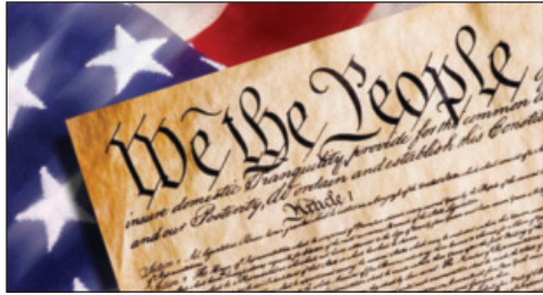
The United States Constitution