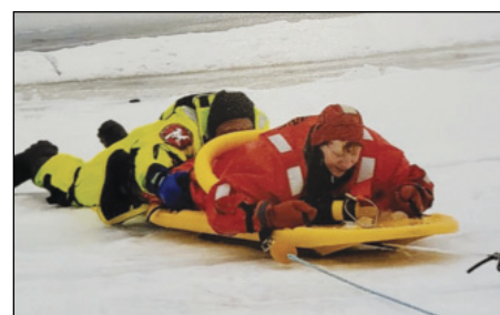
Pulling them to safety with the Ice Sled.

Atlantic Steamer Fire Company has the only Dive Team on the north shore of Nassau County. New members are always welcome. If interested in becoming a Firefighter, EMT, Boat Team, Scuba Rescue Diver, contact the Atlantic Steamer Fire Company at 28 East Main Street, Oyster Bay, or call them at (516) 554-2611.