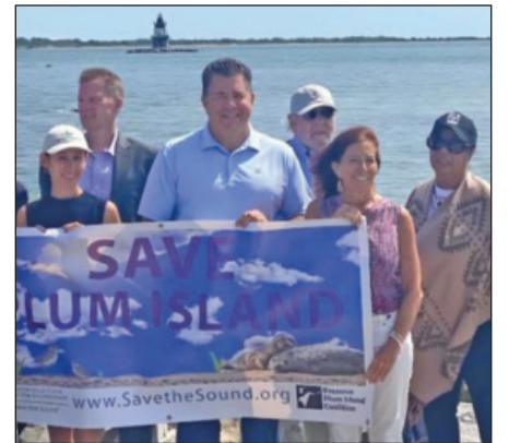
Congressman Nick LaLota

Introduced by Rep. Nick LaLota and others, this bill has been reported out of committee and would direct the U.S. Department of the Interior to conduct a