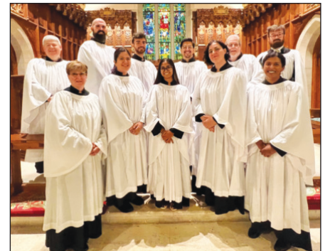
St. John's Festival Choir

ance held in the Gothic inspired Parish Hall at the church.