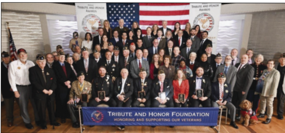
Honorees are seated front and center alongside fellow Veterans and First Responders, with board members, family members, and community leaders gathered behind them.