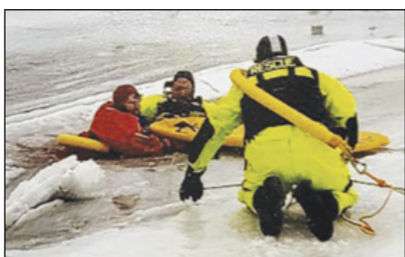
Rescuing someone who fell thru the ice.

Sunday morning, February 15, the Atlantic Steamer Fire Company held an ice water rescue training drill. Members took to the frigid waters at the Theodore Roosevelt Park’s boat ramps, which is adjacent to the fire company’s marine facility, in Oyster Bay. These brave volunteers trained to sharpen their life-saving skills. The bay has not frozen over for several years, so this was a great opportunity for such practice.