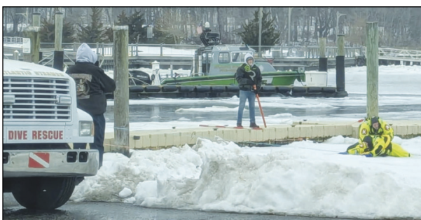
The Atlantic Steamer Fire Company’s Dive Team.

Sunday morning, February 15, the Atlantic Steamer Fire Company held an ice water rescue training drill. Members took to the frigid waters at the Theodore Roosevelt Park’s boat ramps, which is adjacent to the fire company’s marine facility, in Oyster Bay. These brave volunteers trained to sharpen their life-saving skills. The bay has not frozen over for several years, so this was a great opportunity for such practice.