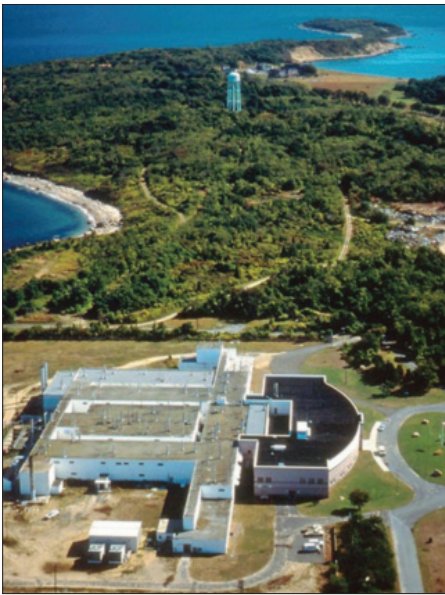
The Plum Island Animal Disease Research Center